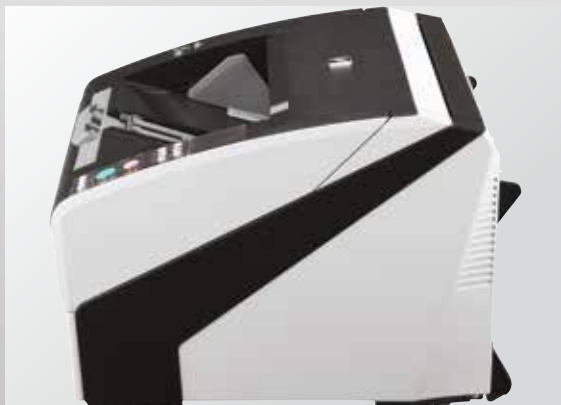
fi-6400 side view

These automated routines can help deliver a performance bonus to document-hungry businesses when archiving records, satisfying compliance requirements and introducing bulk document sets to workflows. The result is a robust scanner with an impressively low total cost of ownership compared to other models within and beyond its class and as such provides a fast return on investment.